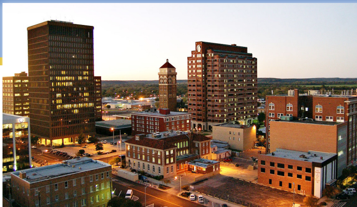
Downtown Bartlesville, looking toward the northwest.